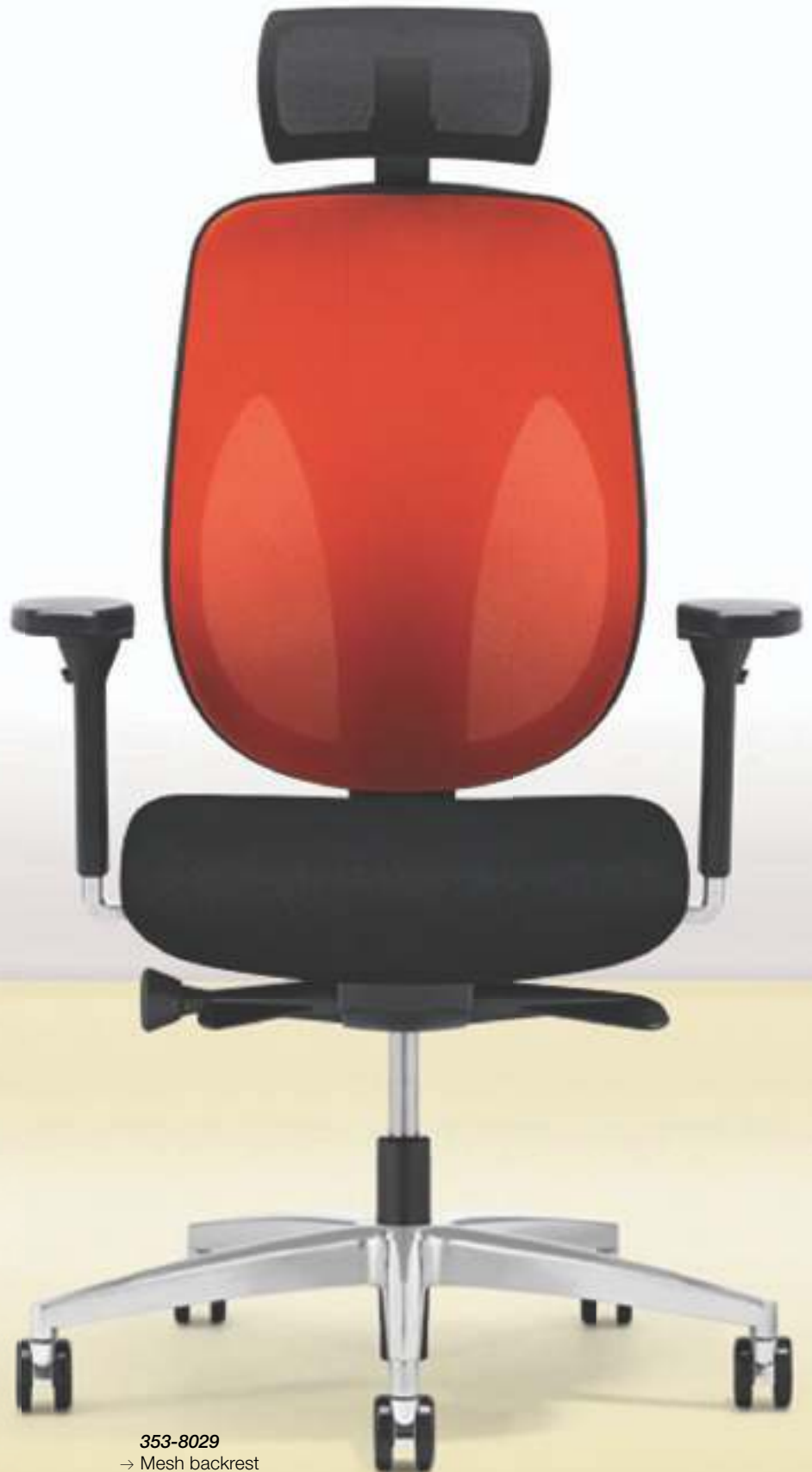
353-8029 → Mesh backrest → Headrest → 4D armrests → 5-arm base in polished aluminium → Castors 65 mm, chromium-plated