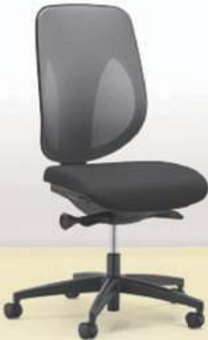
353-4029 → Mesh backrest → Castors 50mm

giroflex 353: available with 3D spacer fabric in a variety of attractive colours. Optionally available with adjustable forward seat tilt, coat hanger and headrest. Choice available of fixed, 2D or 4D armrests. With 5-arm base in black plastic or in polished aluminium.