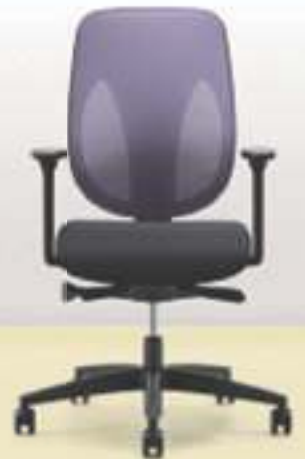
353-8029 → Mesh backrest → Fixed armrests → Castors 65 mm