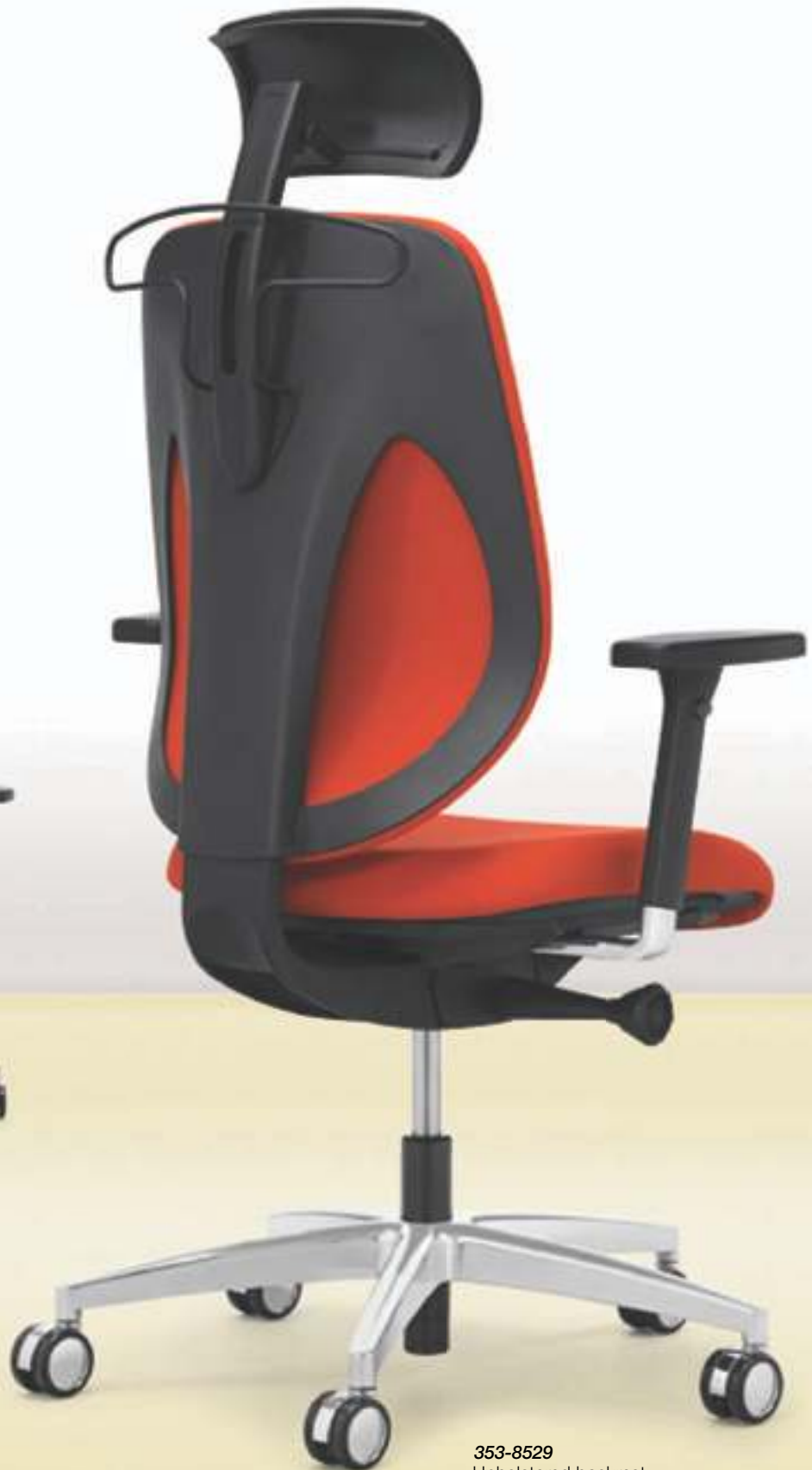
353-8529 → Upholstered backrest → Covered back → Headrest → Coat hanger → 4D armrests → 5-arm base in polished aluminium → Castors 65 mm, chromium-plated