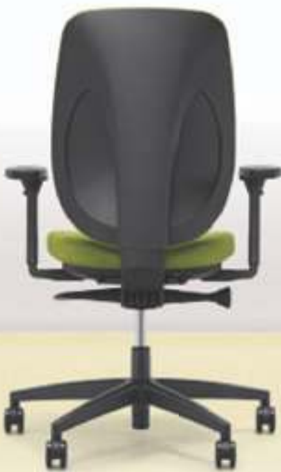
353-8529 → Upholstered backrest → 4D armrests → Castors 65 mm