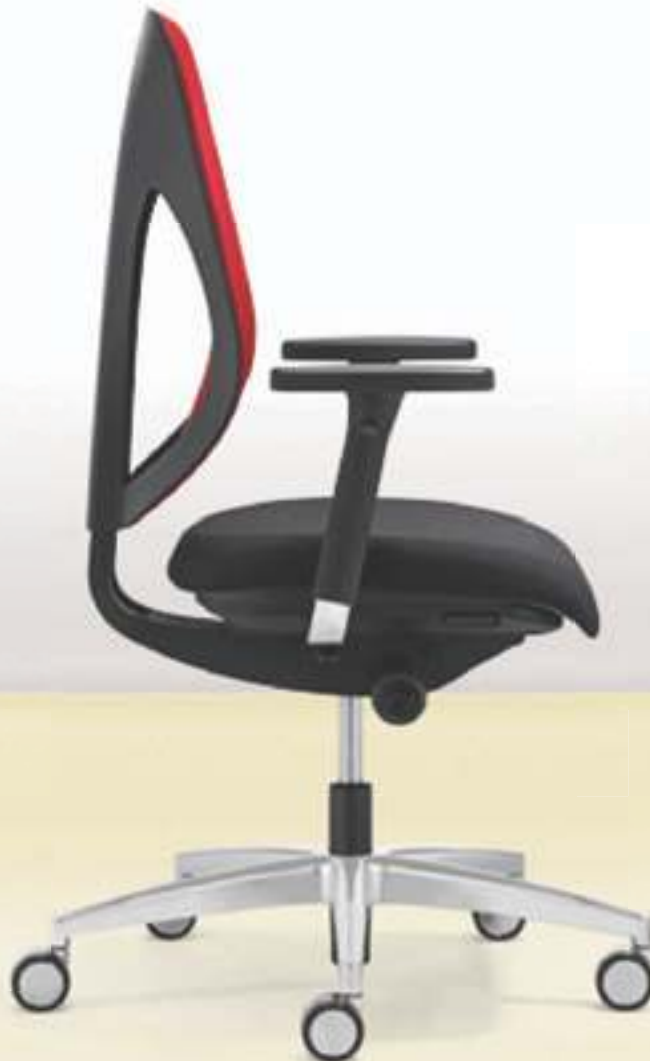
353-8029 → Mesh backrest → 4D armrests → 5-arm base in polished aluminium → Castors 65 mm, chromium-plated