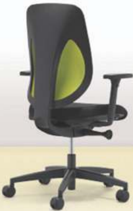
353-8029 → Mesh backrest → 4D armrests → Castors 65 mm